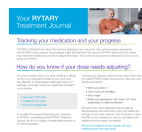
RYTARY Treatment Journal